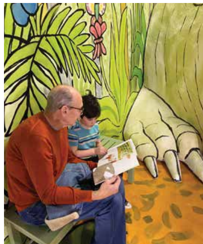
The Rabbit hOle