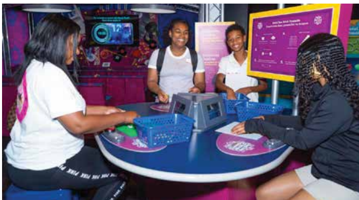
The Science of Guinness World Records at Union Station