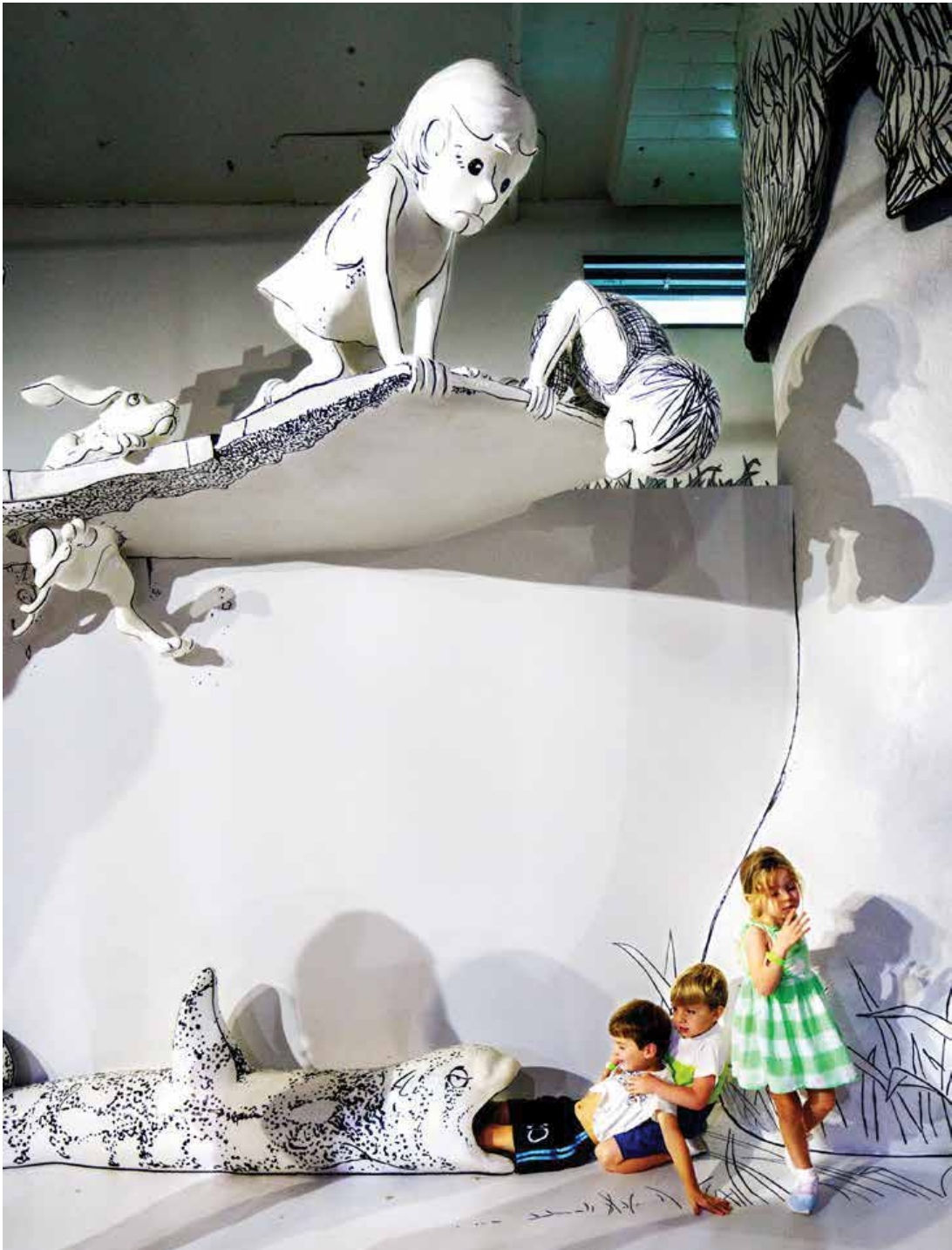
Explore Where the Sidewalk Ends , written and illustrated by Shel Silverstein, at The Rabbit hOLE.