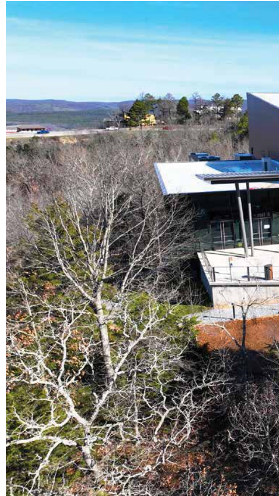
Opera in the Ozarks

from Nebraska, Iowa and South Dakota. Tickets are $10 for ages 13 and up; free for children 12 and under and museum members.