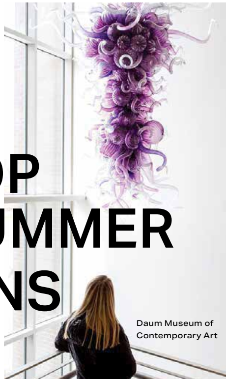
Daum Museum of Contemporary Art