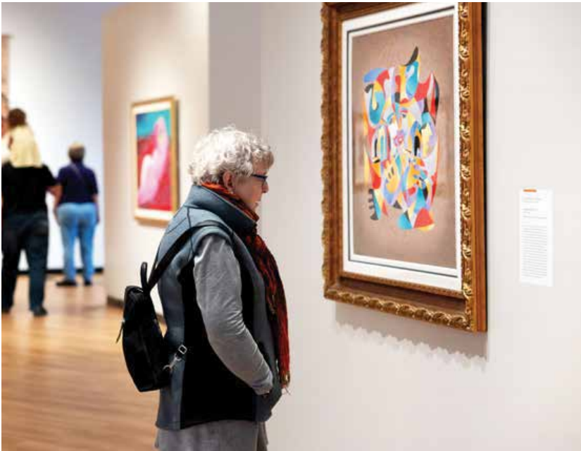
The Museum of Art + Light

Looking for a day trip that blends history, culture and incredible food? Head to Kansas City, Kan., and spend the day walking through stories that shaped the region – one neighborhood, one bite at a time.