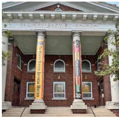
Above: Kansas African American Museum Left: The Museum of Art + Light