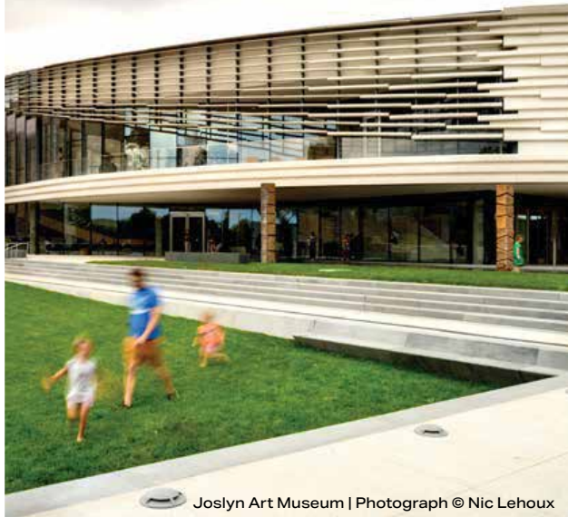
Joslyn Art Museum