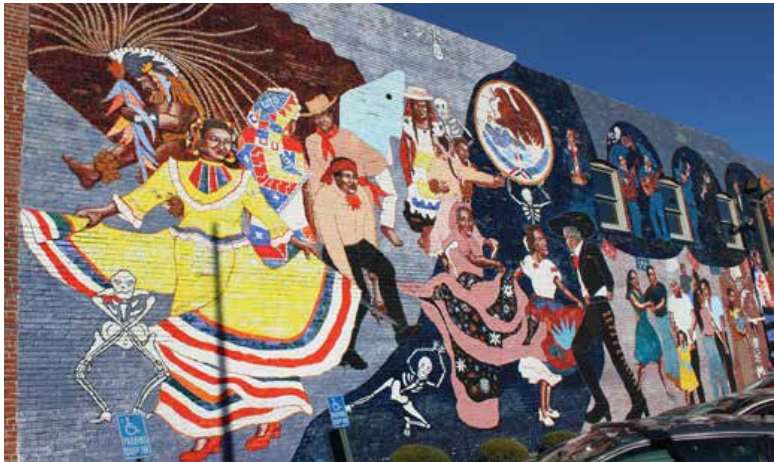
El Baile de la Vida Mural, part of the KCK Legacy Trail

Union Station is now home to The Science of Guinness World Records , a hands-on exhibition where visitors can explore what it takes to make history. Open through Sept. 2 in the Bank of America Gallery, this interactive experience goes behind the scenes of astonishing human feats – from the