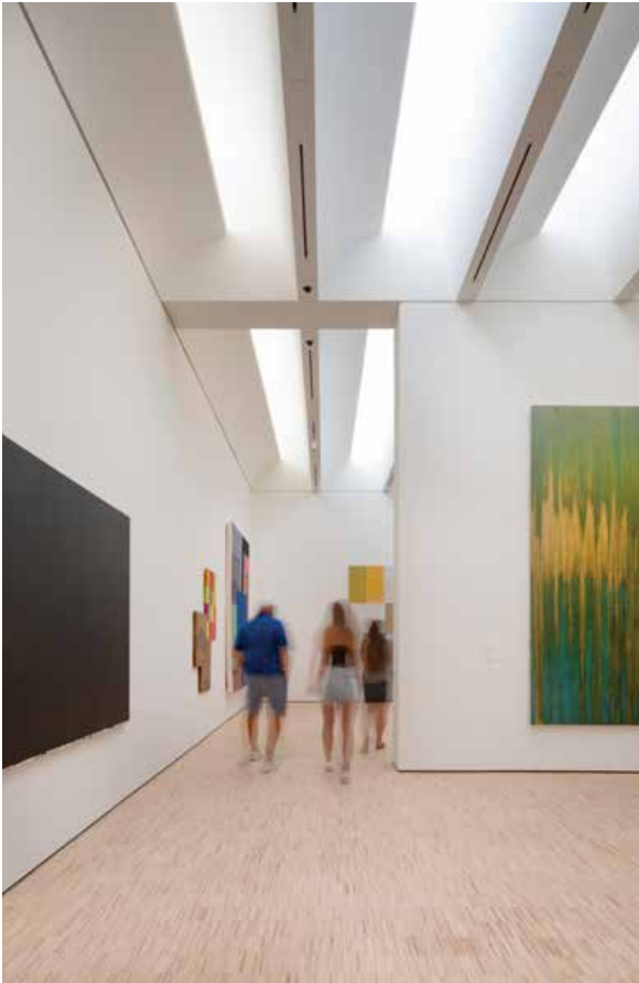
Joslyn Art Museum

views from overlook areas designed to enhance the experience.